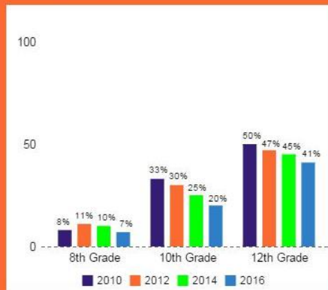
ALCOHOL 30 Day Use Rates

Over the past 6 years, the Illinois Youth Survey results for DuPage County display that substance use has been decreasing every year