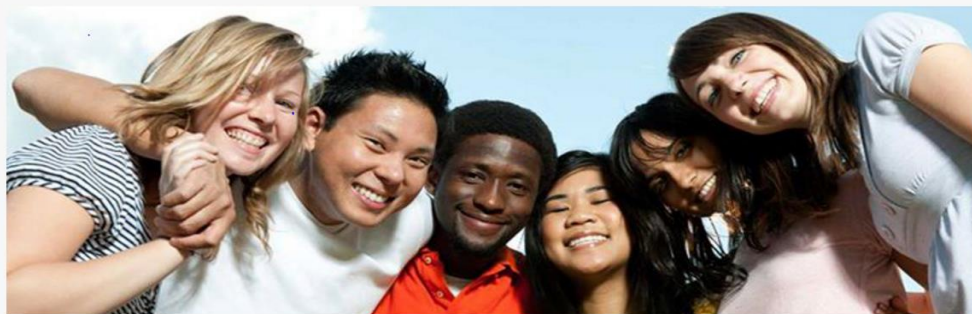
The DuPage County Prevention Leadership Team

Working together to reduce substance use, and increase mental wellness among youth in DuPage County, IL.